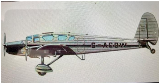
Spartan Cruise aircraft

My first flight was with my mother, from Cowes Isle of Wight to London. We flew in a three-engine Spartan Cruise from a grass airfield with a hangar, offices, and no concrete runway.