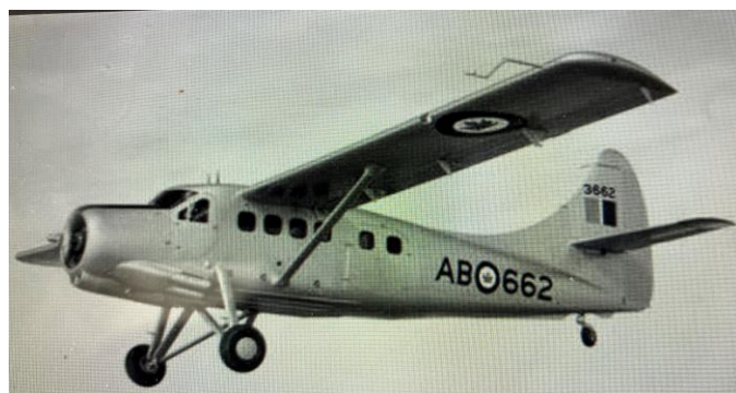
DeHaviland Otter High Wing on Boeing 737

Once, on a return trip, the Otter was still on the ground. When we reached the end of the runway strip, the pilot turned to the passengers and said, "There are too many bananas on board!" A passenger opened his window and began throwing out bananas. Soon, the pilot said, "Okay, we'll try again." We took off with no further problems.